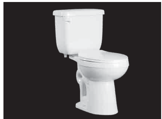
PF1403HEWH / PF5112HEWH